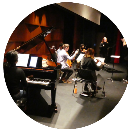
Rehearsals at Dieppe