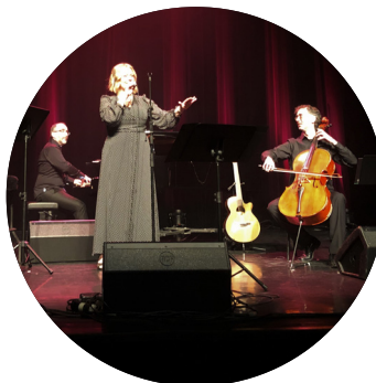
Chapter JMC Rouyn-Noranda Regional Concert