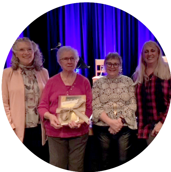
Chapter JMC Port-Cartier Volunteers

As the pandemic is still having an impact on the JMC Chapters' activities, performances of our Emerging Artists Concerts have been reduced. However, regional Chapters have benefited from a dedicated budget envelope allowing them to organize concerts locally, featuring artists from their region, so as to maintain their Chapter's involvement with subscribers and the local community.